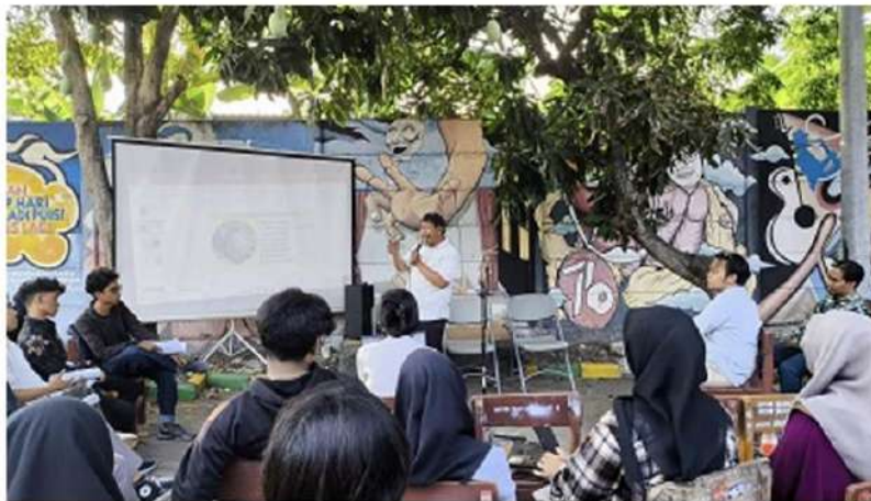
Figure 4. Mentoring and Workshop Phase II Writing Wayang Scenarios

Movies are crucial for maintaining customs and culture. Tuurosong discusses how Dagbani movies help northern Ghanaians live in harmony with one another [12]. The movie focuses on how communities settle disputes among themselves by adhering to traditional peaceful living practices. The movie promotes the ideals of cooperation amongst local groupings. In the meantime, Bahk describes how the narrative of the movie "Medicine Man" influenced local perceptions on forest preservation [13]. It is also stated that movies can serve as a tool for moral education and the preservation of culture and values [13].When it was clarified that the competition's theme was subject to imaginative interpretation, the contestants' excitement grew. Some participants even began to share their novel ideas, which included fusing mystery, science fiction, and family drama aspects with wayang characters. It is anticipated that the flexibility to explore wayang would inspire creativity in telling the next generation of traditional stories. As a result, wayang is regarded as both a contemporary creative inspiration that can coexist with popular culture and as a cultural legacy of the past.