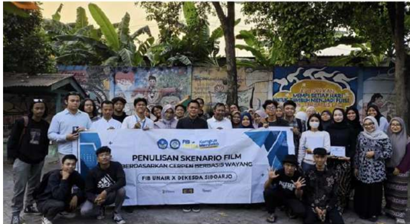
Figure 5. Mentoring and Workshop Phase II Writing Puppet Scenarios

Z's interest. This change will make wayang relevant and engaging for the younger generation, who live in a society that is becoming more and more connected through digital means, while preserving its philosophical ideals.