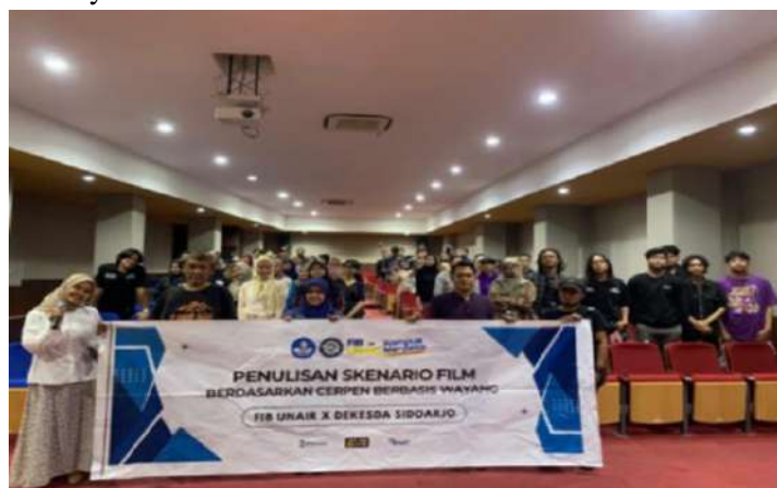
Figure 3. Socialization of the Stage I Wayang Scenario Writing Competition and Workshop

Furthermore, it serves as a platform for fostering communication amongst members from all backgrounds, particularly between the Dekesda community and other film communities. Participant experiences and ideas for creating stories based on local culture are exchanged through participatory discussions. Along with encouraging participants' passion for producing works that are not only aesthetically pleasing but also rich in Wayang cultural values, this event serves as a first platform for them to get ready before moving on to a more in-depth workshop stage. It is anticipated that this partnership would create new avenues for investigation into the fusion of contemporary creativity and tradition.