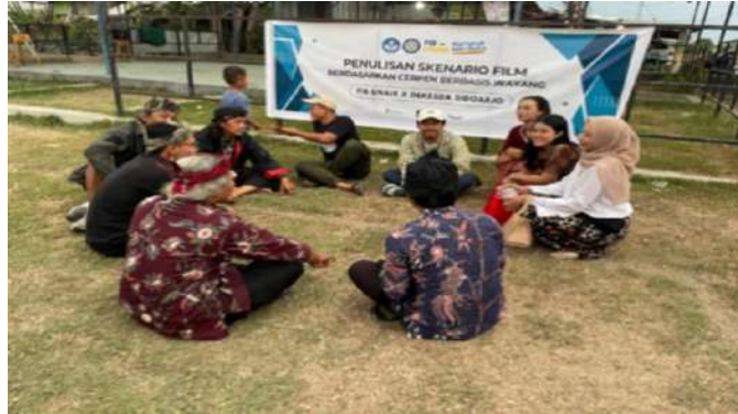
Figure 2. Coordination Meeting for Preparation of Wayang Scenario Writing Workshop

recording process, production is the actual image and sound recording process, and post-production is the activity that happens after the recording is complete. Preparation, the launch of screenplay writing support programs, and film script writing contests based on Wayang stories are the activities that comprise this community service. Together with the Sidoarjo Arts Council and the film community, the community service team prepared for the first phase.