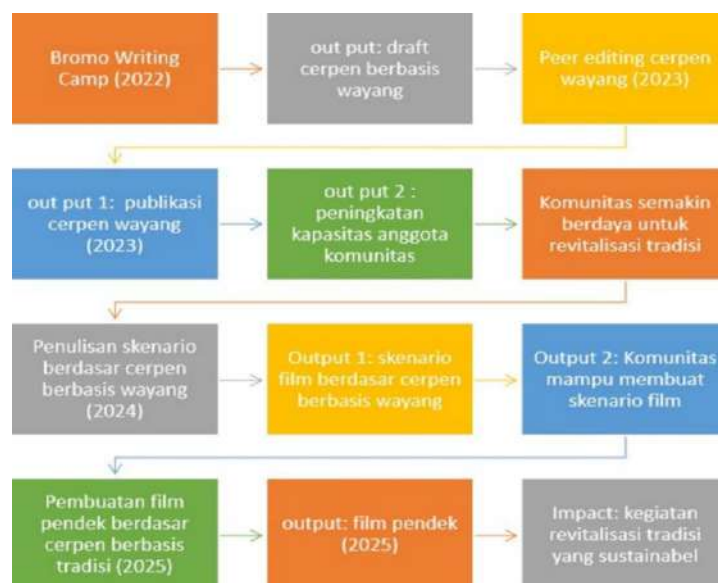
Figure 1. Community Service Activity Flowchart