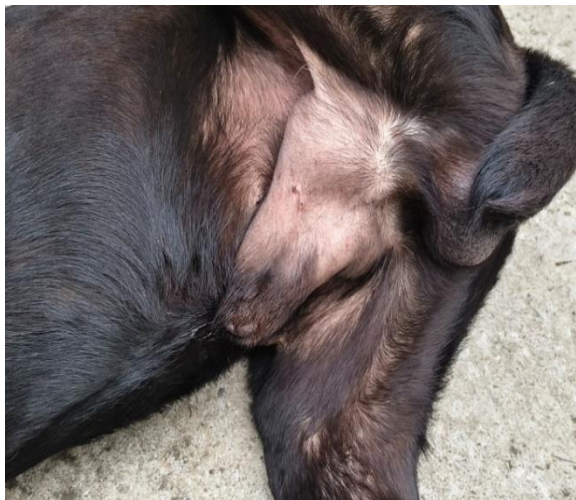
Fig 1: Pictures Depicting Tumor Mass At Base Of Penis.